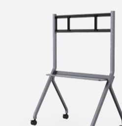
Mobile Stand (ST41B)