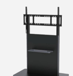
Mobile Stand (ST23C)